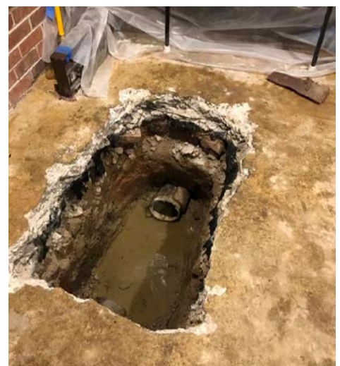
Sewer lines lined and ready for check valves >