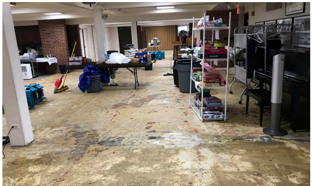
▲ The challenges start – a mess with glue-covered tile